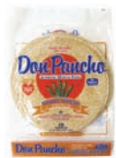
Don Pancho Whole Wheat Tortillas (16 oz)