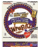
Wrap-itz 100% Stone Ground Whole Wheat Wraps (12 oz)