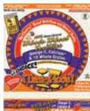
Tam-x-ico's 100% Stone Ground Whole Wheat Tortillas (12 oz)