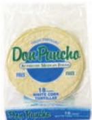
Don Pancho Corn Tortillas (White or Yellow) (16 oz)